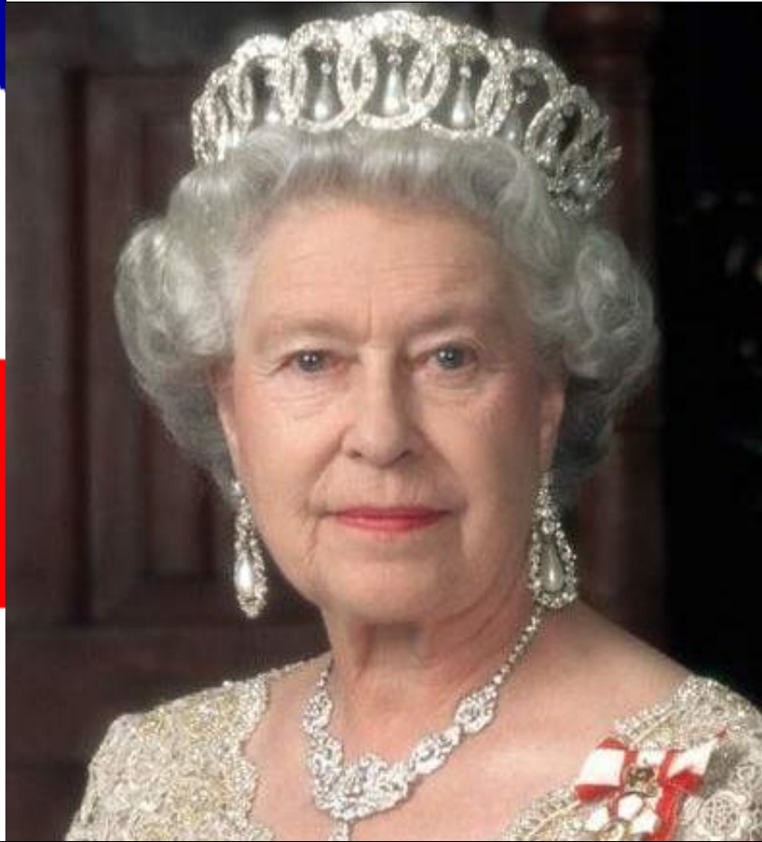
Queen Elizabeth II

The Queen is the head of our country, the United Kingdom.