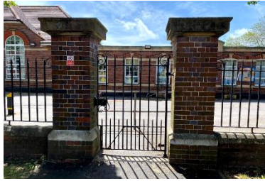
Year 4 gate