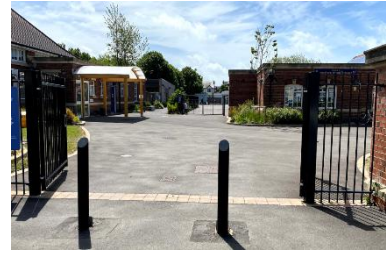
Main gate to Yr 3 gate